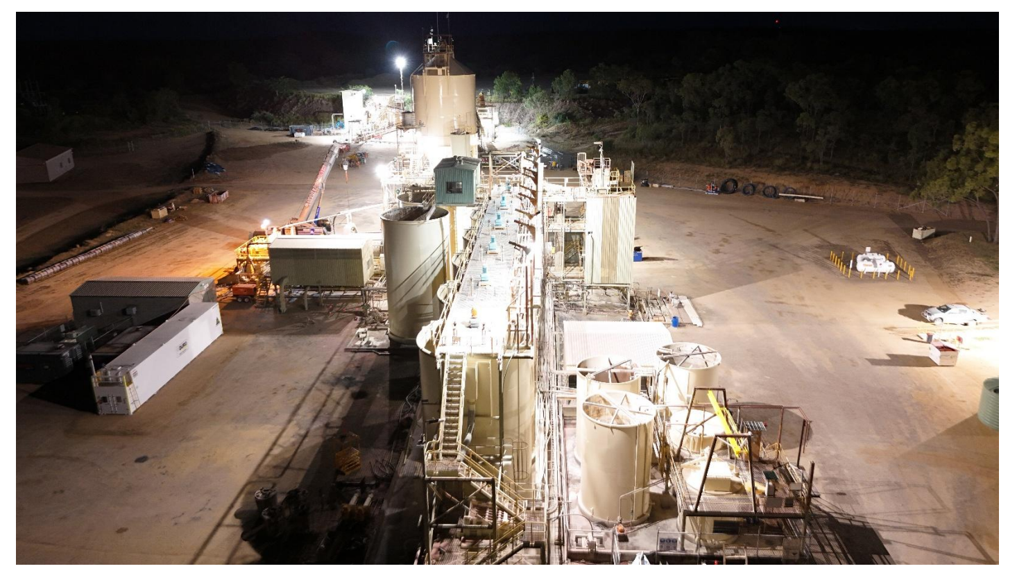
Figure 3: Night view of Blackjack Plant