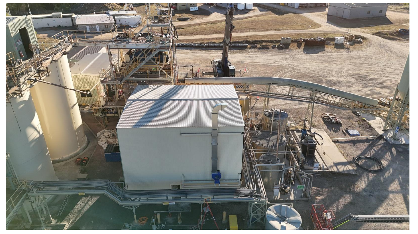
Figure 4: New gold room with new equipment