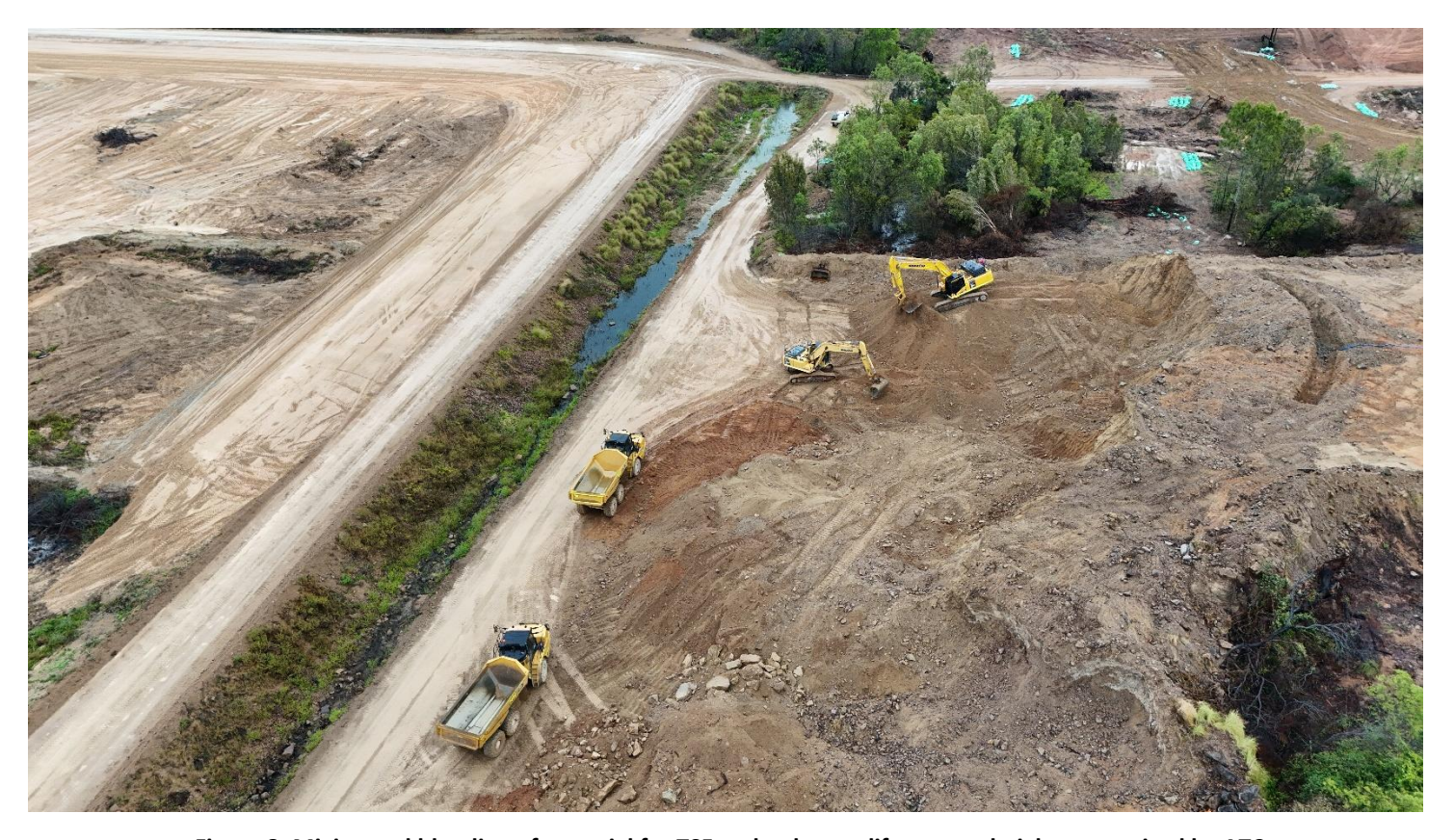
Figure 8: Mixing and blending of material for TSF embankment lift to crest height, supervised by ATC Williams