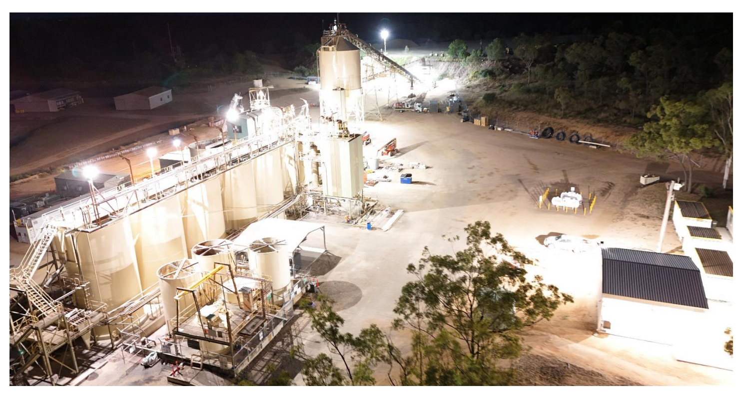
Figure 1: Night view of the NMR Processing Plant illuminated during final pre-commissioning inspections, highlighting progress toward operational readiness.

Native Mineral Resources Holdings Limited (ASX: NMR ) (" Native Mineral Resources " or the " Company ") is pleased to provide a progress update on the restart of its Blackjack Gold Project in Charters Towers, Queensland. The Company remains on track for first gold production by the end of July 2025, with commissioning activities accelerating across the processing plant, mining operations, and supporting infrastructure.