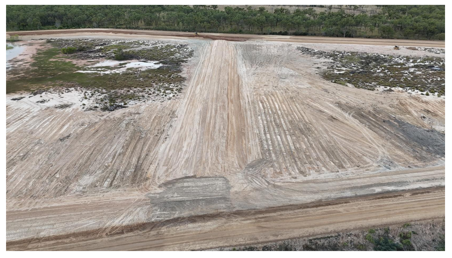
Figure 9: TSF temporary bund wall separating northern and southern cell