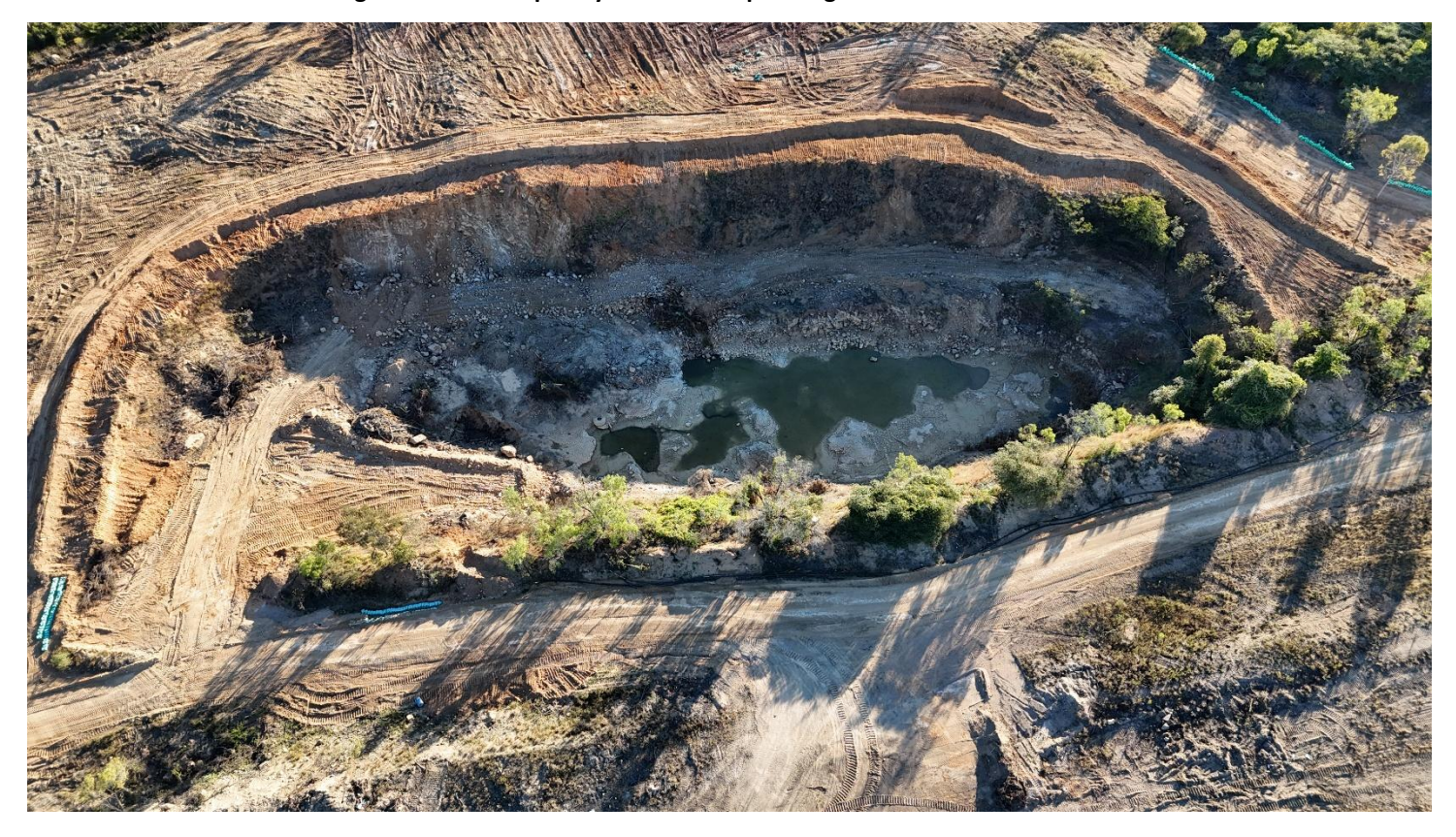
Figure 11: Initial open-pit benching development