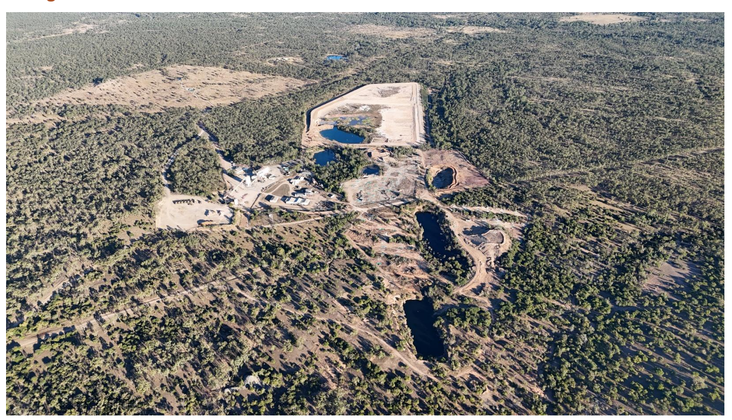
Figure 2: Aerial view of the Blackjack operation as at 13 June 2025