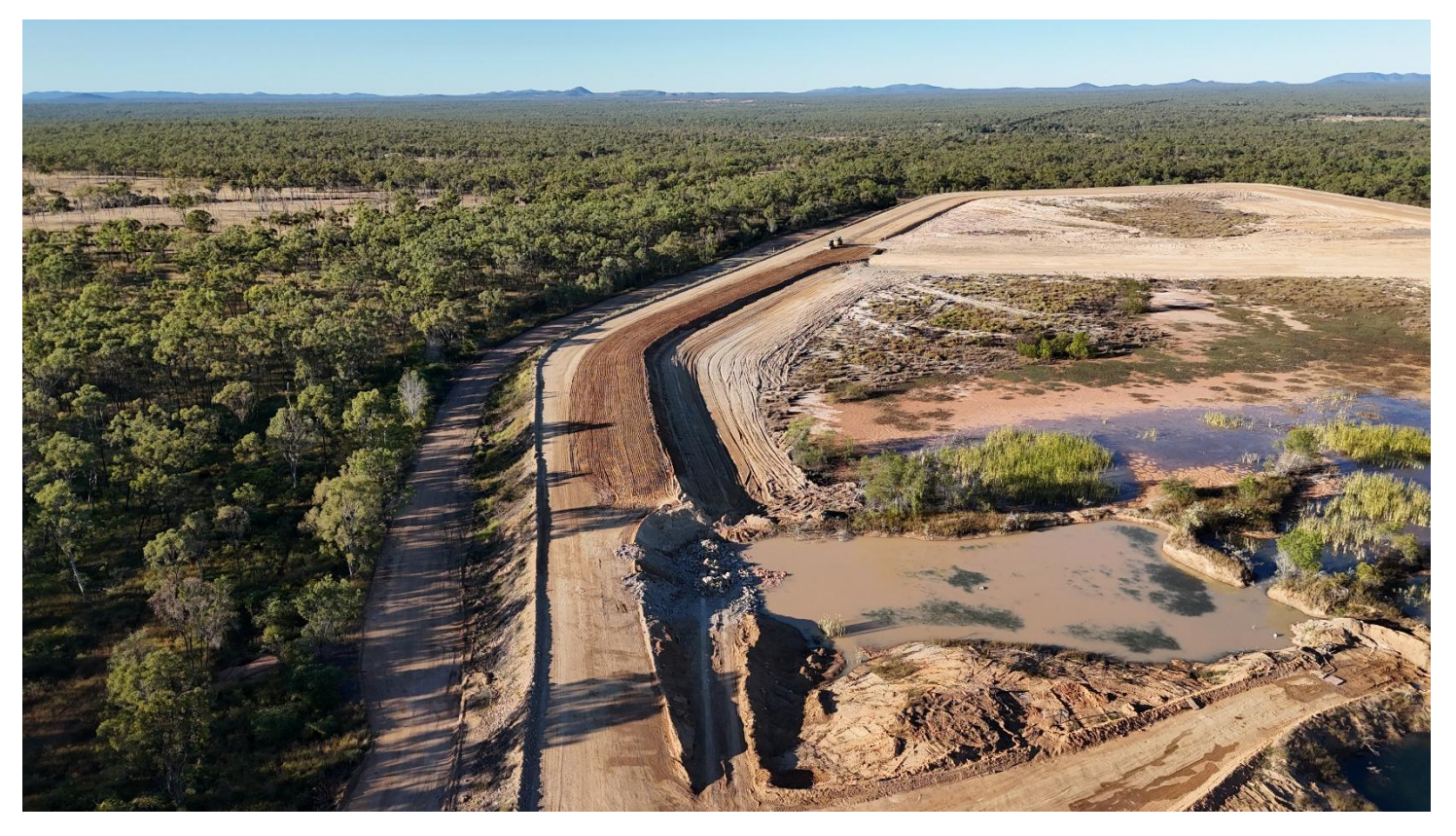
Figure 10: TSF temporary bund wall separating northern and southern cell