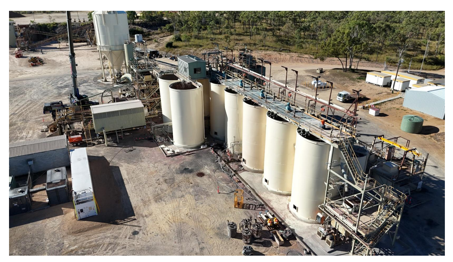
Figure 5: Major blast and paint works completed