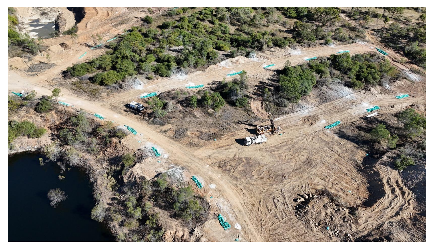
Figure 6: Resource drilling ongoing for pit design and block modelling